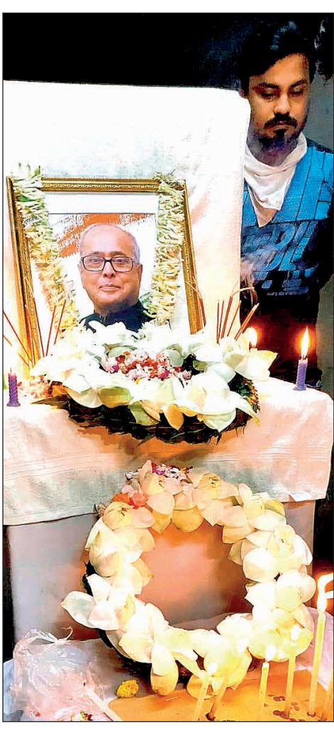
প্রদেশ কংগ্রেস কার্যালয়ে শ্রদ্ধা।

সবারে আমি প্রণাম করে যাই। সবাইকে তোমার চিরবিদায় জানাতে তোমারই প্রিয় কবিকে উদ্ধৃত করার স্বাধীনতা নিলাম। দেশের জন্য, মানুষের জন্য পুরোপুরি অর্থাৎ জীবন যাপন করছি। তোমার মেয়ে হিসেবে জন্মে আমি ধন্য।