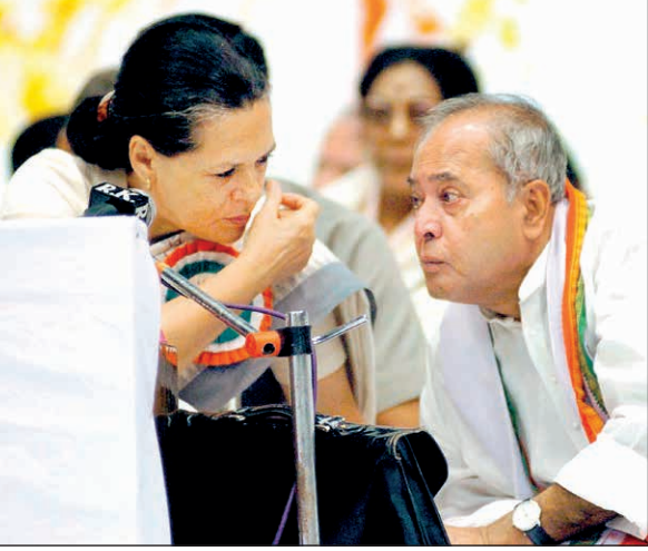
শিখেছি অনেক: সোনিয়া

ভারতীয় রাজনীতির একটি যুগের অবসান হল। আমরা গভীর শোকসন্ত্রস্ত। তাঁর প্রয়াণে যে রাজনৈতিক শূন্যতা তৈরি হল তা অপূরণীয়। সর্বভারতীয় রাজনীতির অন্যতম উজ্জ্বল এক নেতৃত্বকে হারালাম।